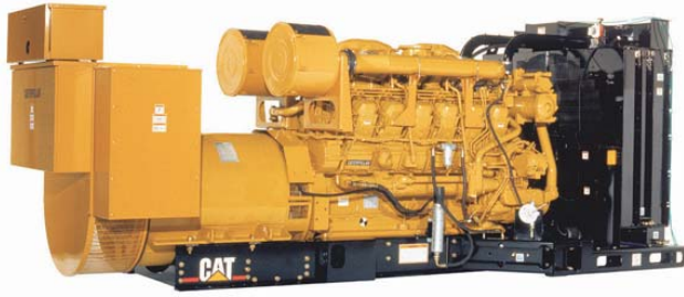
Image shown may not reflect actual package.

STANDBY 1200 ekW 1500 kVA 50 Hz 1500 rpm 400 Volts