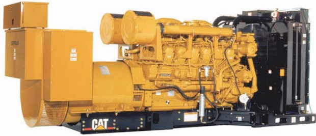
Image shown may not reflect actual package.