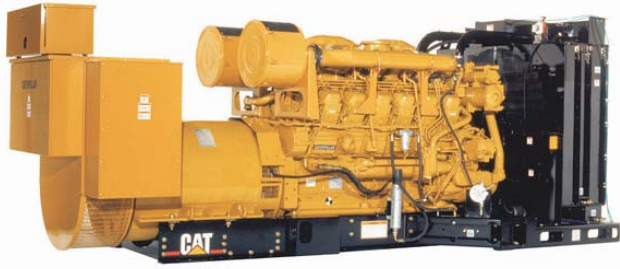
Image shown may not reflect actual package.